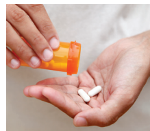
Mental health & substance use