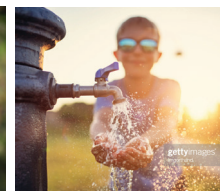
Air & water quality

Knowing that we are stronger by working together, we partner with community organizations on specific strategies that target the top four health challenges facing Lancaster County. We strive to influence health where people live, work, play and learn.