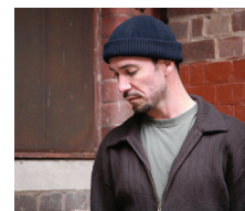
Social determinants of health

We work to improve the health and well-being of the communities we serve by identifying and addressing our community's most pressing health concerns. Today, those priorities are addressing the social determinants of health; improving access to mental health services and addressing substance abuse; promoting healthy eating and active living; and improving air and water quality.