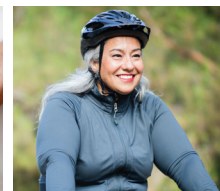
Healthy eating & active living